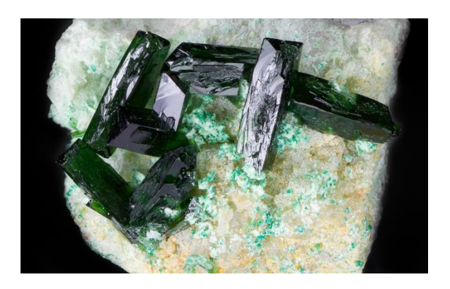
Figure 3. Libethenite, Chino Mine, 8mm Fov.