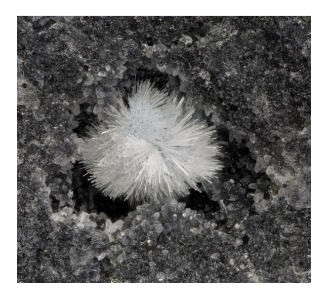
Figure 4 Raydemarkite, Cookes Peak, Summit Group, 2mm Fov.