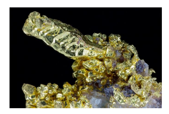
Figure 2. Gold, San Pedro Mine, 9mm Fov.