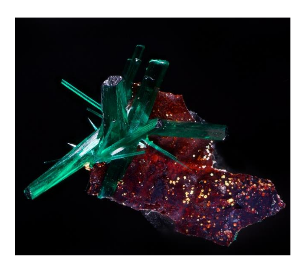
Figure 1. Brochantite, Brochantite, Mex Tex Mine, 6mm Fov.