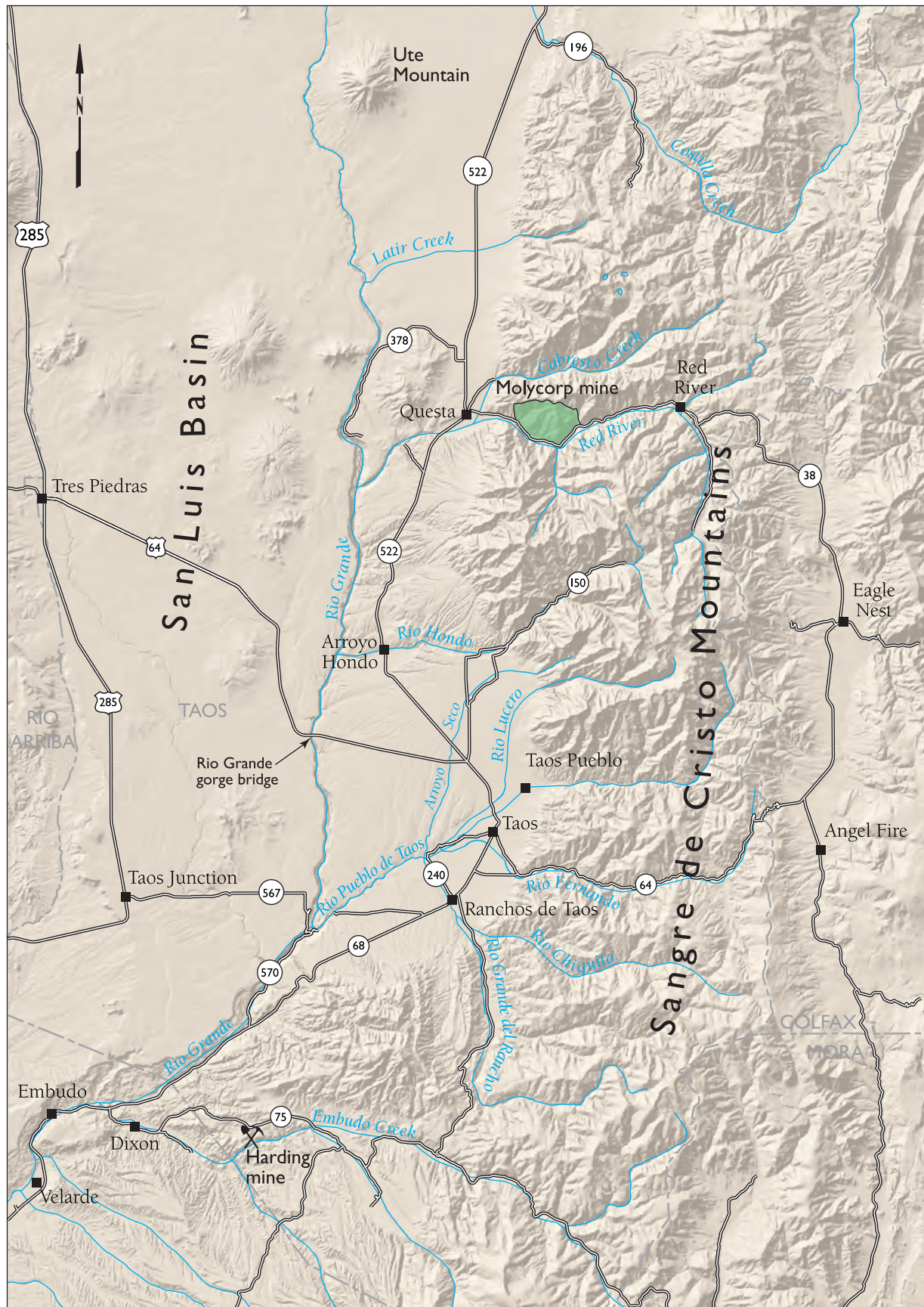
Map of field trip area.