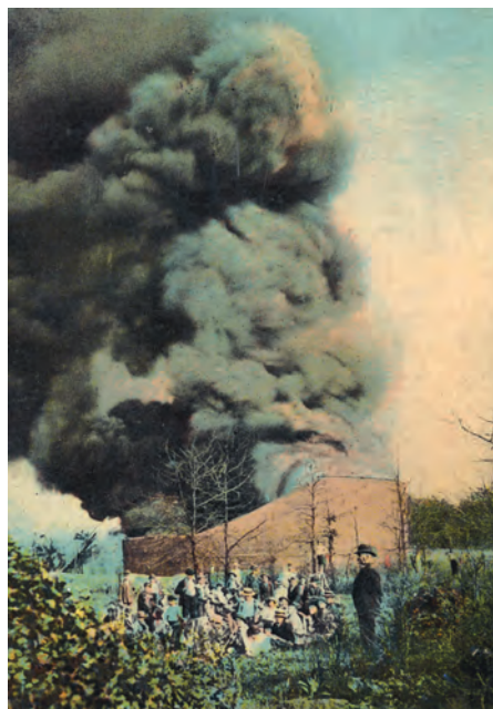
A postcard depicting a burning oil storage tank in western Ohio from around 1910. Note the well-dressed citizens who have come out to have their group portrait taken in front of the billowing plume of black smoke.

The point to be made here is that it is not really fair to hold modern industry solely responsible for the sins of earlier days. There is indeed a legacy of spoiled landscapes, air and water pollution, collapsing mine shafts, and other problems associated with past min-