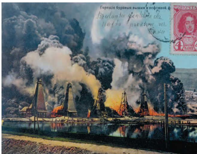
A postcard view of a raging oil field fire from around 1900. Such fires were common occurrences given forests of wooden derricks that virtually touched at their bases, uncovered rivers and lakes of oil (foreground), and the common use of open blacksmith fires for dressing the cable tools used to drill these wells. This postcard is from Baku in the Russian Empire (now Azerbaijan), but comparable scenes were common in U.S. oil fields of the time.

ing, in New Mexico and throughout the nation. But in earlier days there was no widespread recognition of the potential problems, no scientific information on the health effects of pollutants. Instead, there was widespread jubilation at the jobs and wealth that mining and other extractive industries brought to the economy of a struggling and growing nation.