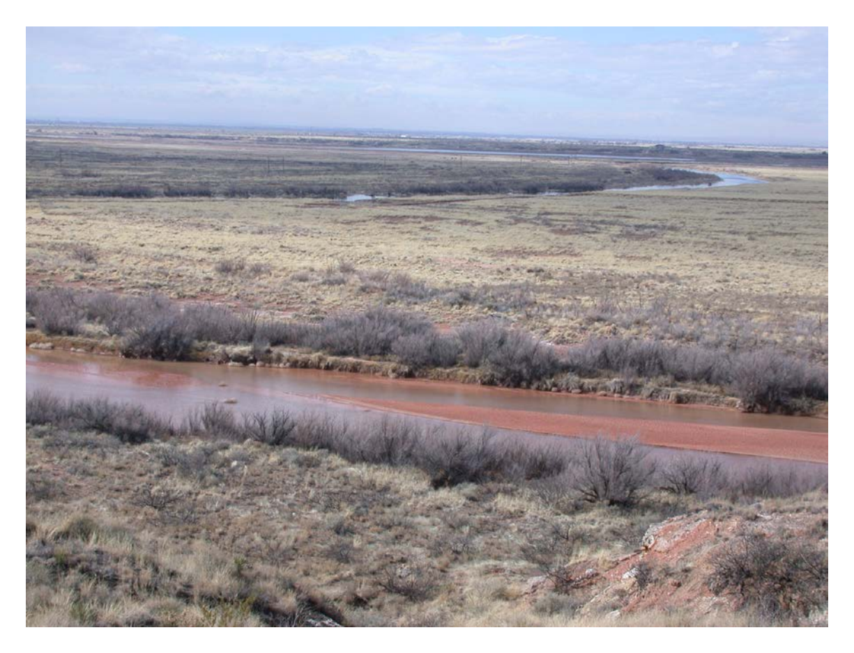
Figure 3. A view of both the modern Pecos River meander belt in the foreground and a sweeping 1939-40-vintage meander in the upper distance. The lower of the two major 1950s cutoffs occurred just out of the picture to the left.

recent meander belt deposition and/or agriculture, amplitudes are estimated to average about 1 km in width with one amplitude of about 2 km in width.