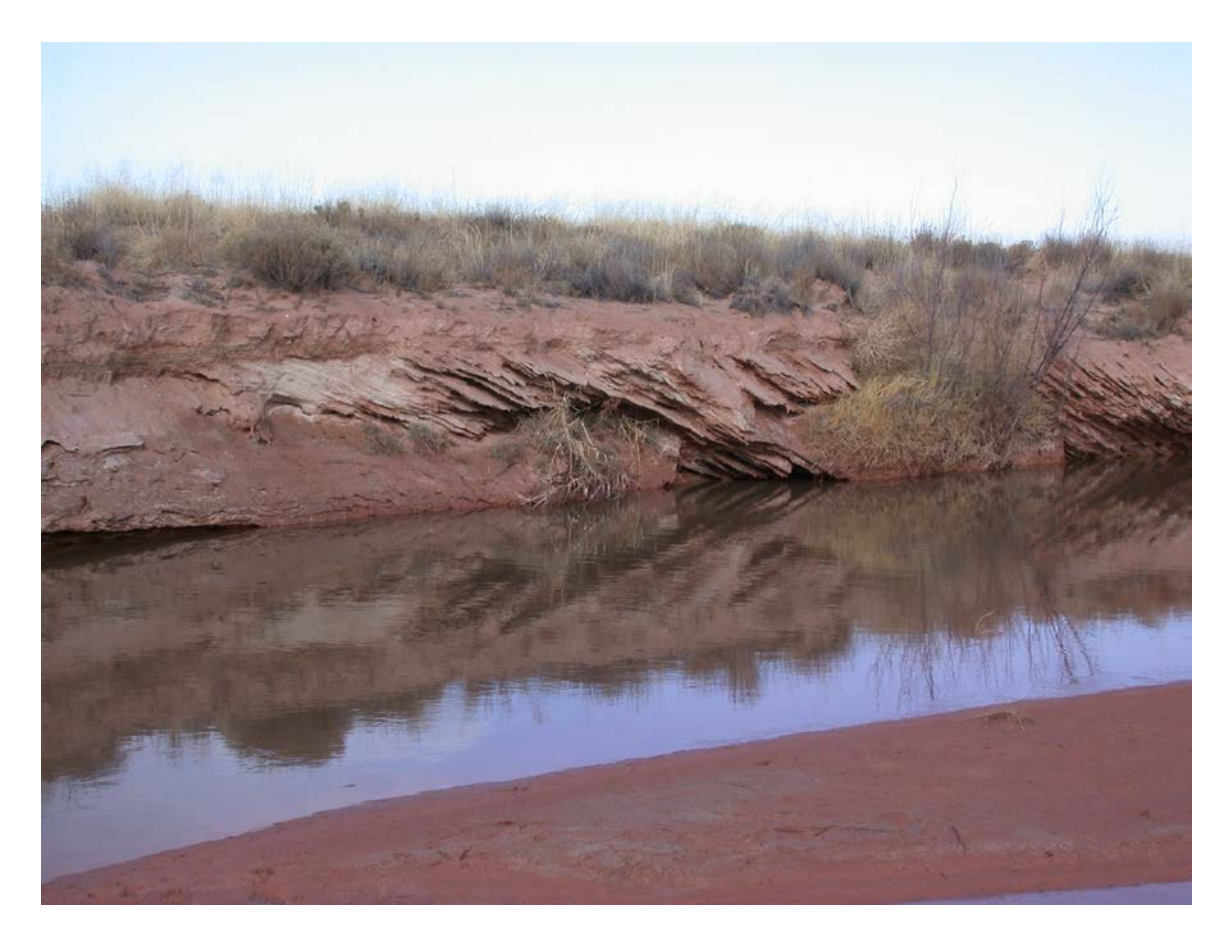
Figure 1. The modern Pecos River is incised into Seven Rivers formation gypsum in the northeastern part of the quadrangle. Dormant salt cedar ( Tamarix pentandra ), growing along the shore on the right, are approximately 1.5 m in height. Note that the alluvium on top of the gypsum is <1 m in thickness.

Aside from the eastern Permian uplands, the Pecos valley, and the Rio Hondo valley, the majority of the surface area of the quadrangle is comprised of Pleistocene alluvial terraces of the Pecos: the Lakewood, Orchard Park, and Blackdom (from youngest and lowest in the landscape to oldest and highest, respectively). First described in the classic work of Fiedler and Nye (1933), this terrace stratigraphy is still applicable today, although we now recognize 3 terrace levels of the Lakewood, two of which are younger and lower than that of Fiedler and Nye. The Lakewood flanks both the Pecos floodplain, and its tributaries (which include the Rio Hondo as well as Borrendo Creek, a