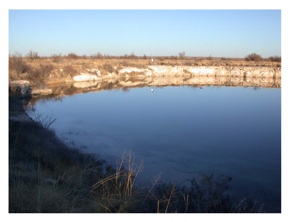
Figure 8. A view of the northern third of Lake St. Francis, one of the largest sinkholes in the BLNWR. A hydrologic monitoring station is seen on the far shore.

Holocene and upper Pleistocene, as lake levels expanded and contracted, water flowed between these shallow basins, giving rise to a somewhat unique lacustrine-alluvial complex deposit ( Qla ). Further work mapping shorelines and coring lacustrine sediments for Holocene paleoecological data are needed here.