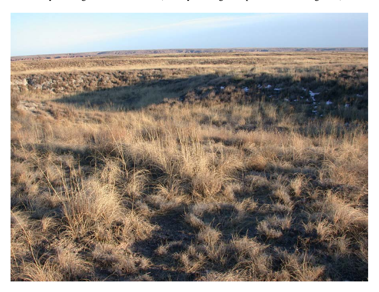
Figure 6. A typical depression pitting the surface of the Orchard Park terrace. The eastern Permian uplands are on the skyline.

Depressions and sinkholes are numerous throughout the Bitter Lake quadrangle. Created by either gradual subsidence (usually leading to depressions - see Figure 6)