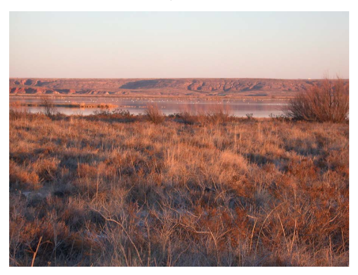
Figure 2. Late afternoon view across Bitter Lake to the eastern Permian bluffs and uplands of the Seven Rivers formation at the eastern edge of the Pecos floodplain. Numerous snow geese can be seen on the lake. At the base of the bluffs on the left, the Lakewood and Orchard Park terraces are evident.

All surficial depositional units of the Bitter Lake Quadrangle are late Neogene in age with the exception of the eastern Permian uplands and their bluffs, which are comprised of Artesia Group (Guadalupian) Seven Rivers formation gypsum, with redbeds of siltstone, and sandstone (see Figure 2). Underlying Psr , seen in well records and the cross section only, are the oldest formations of the Artesia Group, the Grayburg and Queen formations, here undifferentiated ( Pgq ). Below these, are the San Andres formation (Psa) and the Yeso formation ( Py ).