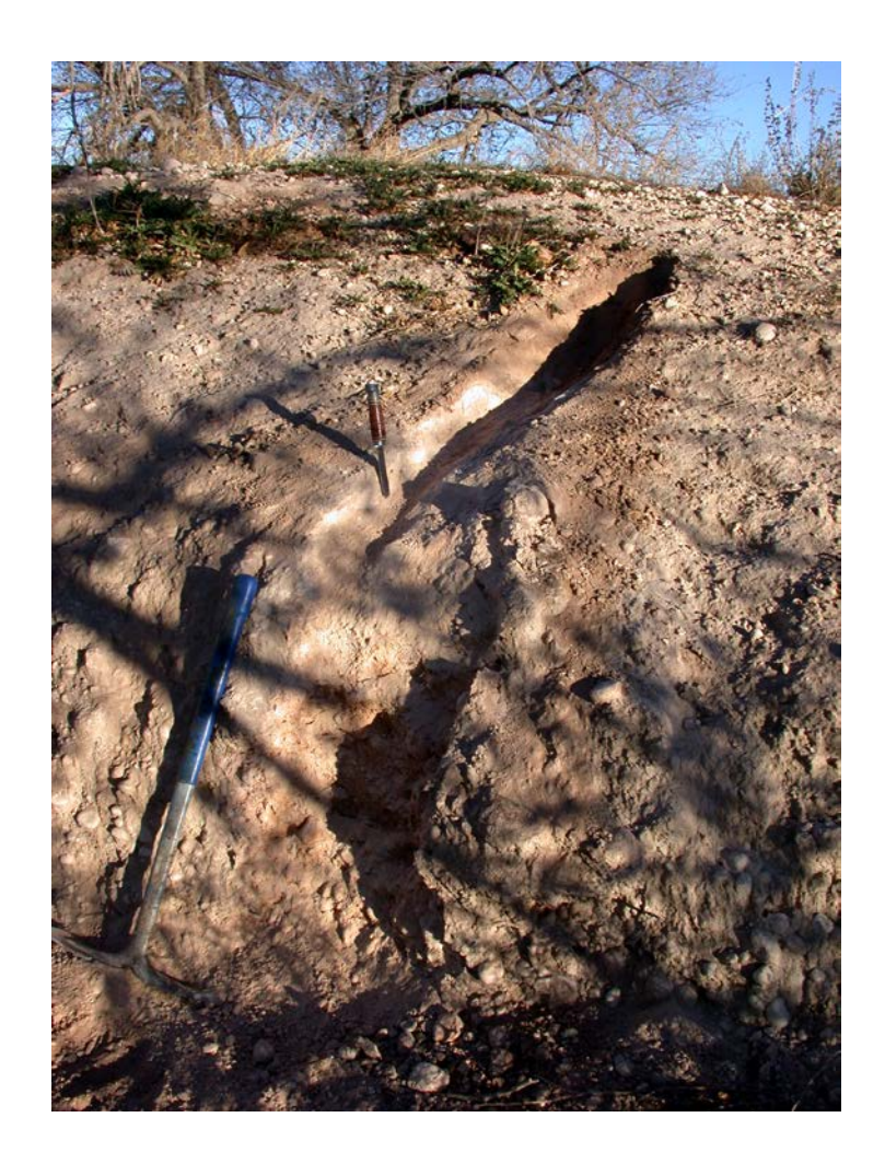
Figure 5. Exposure of the soil developed in the oldest Lakewood terrace deposit (Qlt_1) , in the Rio Hondo valley, displaying a stage III+ pedogenic carbonate morphology (the top of the bk-horizon is at a depth of 28 cm).

actually be an outcrop of the Gatuña Formation (Kelley, 1980; Powers and Holt, 1993) as the lithologic characteristics are essentially identical, but given its roughly parallel proximity to the Pecos floodplain, we map it as Qoae .