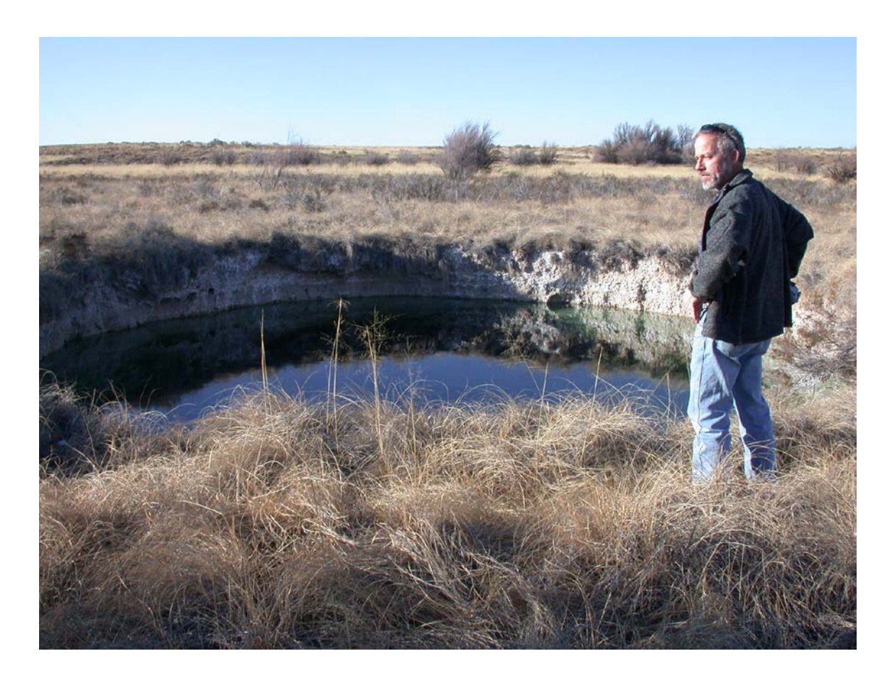
Figure 9. Small sinkhole developed in the Orchard Park terrace, just west of Bitter Creek in the BLNWR. More than 40 cm of gypsite is exposed in the sinkhole wall.

southern two thirds of the quadrangle. The gypsum content decreases gradually northward, with a concomitant increase in clastic interbeds of siltstone and sandstone. North of the latitude of the wildlife refuge headquarters, gypsum comprises only about 25% of the unit. Gypsum beds are thin- to thick- to very thick-bedded, and massive to thin-bedded to laminated internally. Red outcrop color is due to surface wash from the clastic interbeds. These clastic layers often contain veins of gypsum. Bedding is irregular and highly variable where gypsum content is high. As gypsum content decreases, bedding becomes thinner and more planar, with less development of collapse features and