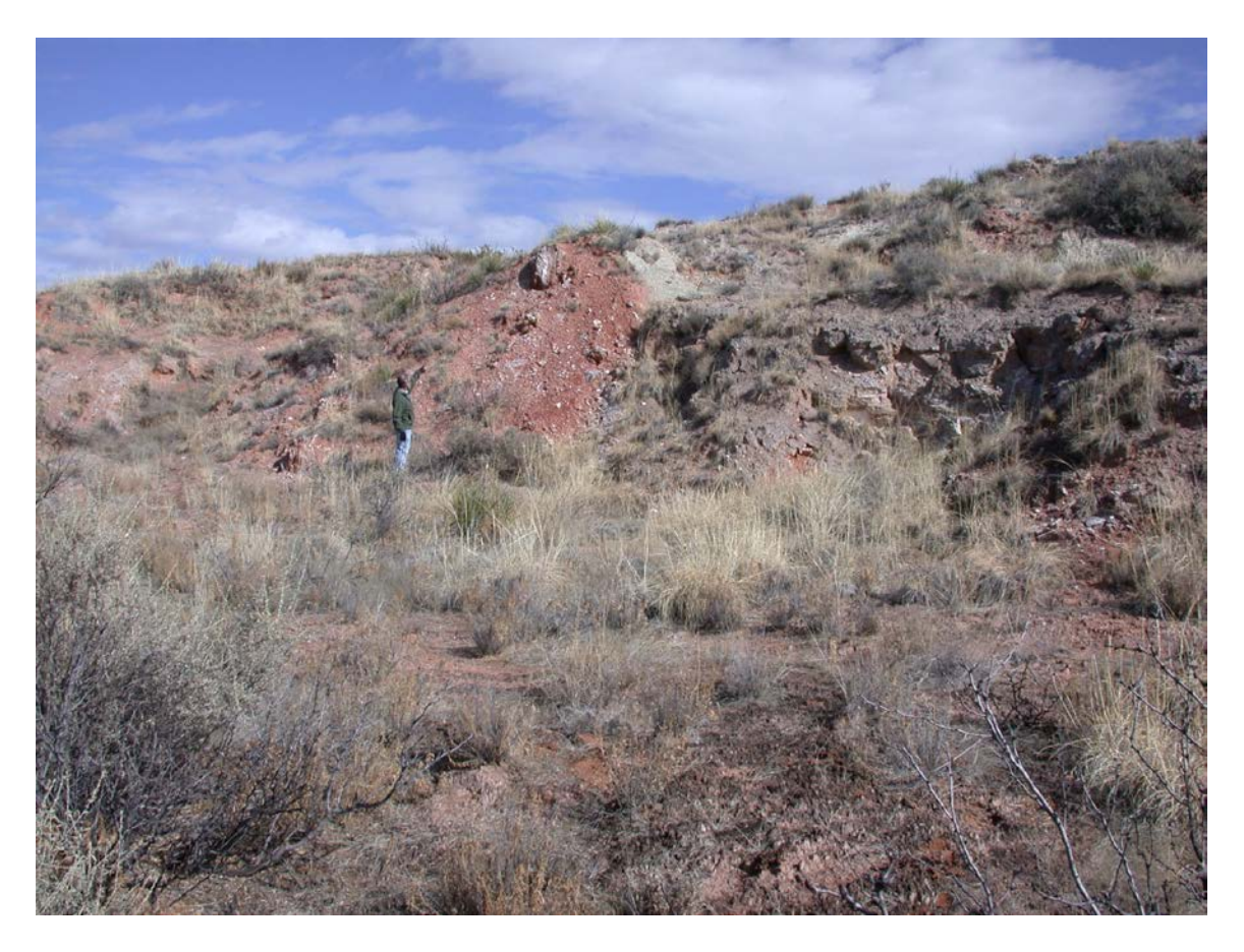
Figure 10. SW-facing exposure of the Y-O Buckle coming out of the Pecos floodplain alluvium. The outcrop falls just east of the eastern edge of the Bitter Lake quadrangle, within the Comanche Spring quad.

to the west, the Six-Mile Buckle, approximately 7.5 km west of the Bitter Lake quad, is a left lateral strike-slip fault system, or buckle. Its strike changes from about N 62° E at about the latitude of the northern edge of the Bitter Lake quad (33°30'N) to N 45° E, northward. These two essentially opposite movements along these Pennsylvanian-Permian structures, clearly "wrenched" the Permian evaporite facies rocks and controlled the overall pattern of jointing and development of zones of weakness here between these structures. Underlying bedrock collapse or subsidence, leading to surficial depression or sinkhole development, has clearly occurred by in large along these joints and