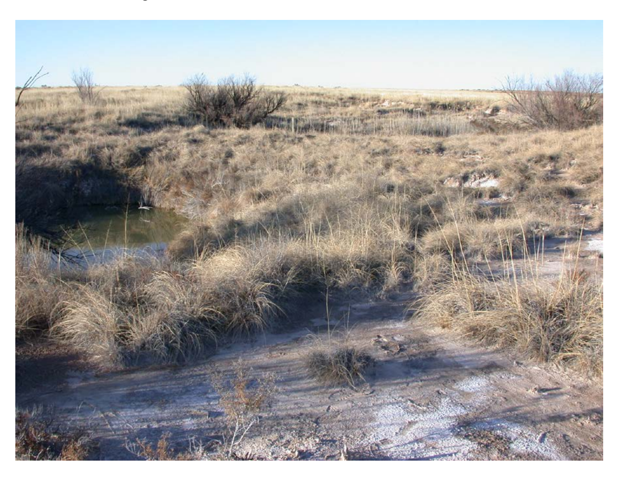
Figure 7. A small sinkhole on the middle Lakewood terrace (Qlt_2) . Note the gypsiferous crust in the foreground.

often approaching 20 m, are common on the lower two Lakewood terraces on the BLNWR (see Figures 7 and 8), as well as on the upper to middle Pleistocene Orchard Park terrace (see Figure 9).