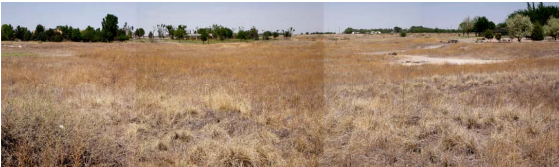
Figure 1. Panorama of the extinct South Spring looking north to northeast. The spring used to issue out of the low-lying, gray, lacustrine sediments in the foreground-right, and flowed to the Pecos River, some 8 km distant to the north and east.

Both the alluvial valley and the large alluvial fan complex lie within the northern Roswell artesian basin, which are comprised of both a shallow alluvial aquifer and an underlying artesian aquifer within the Permian San Andres formation. These aquifers have supported extensive agriculture since the late 19 th Century here. Artesian springs (e.g, South Spring) commonly exhibited perennial discharge in historic times, but are mostly now extinct due to aquifer pumping for agriculture (see Figure 1). Of the 8 springs mapped on the quad, all but the three along the Pecos River floodplain margin are now extinct.