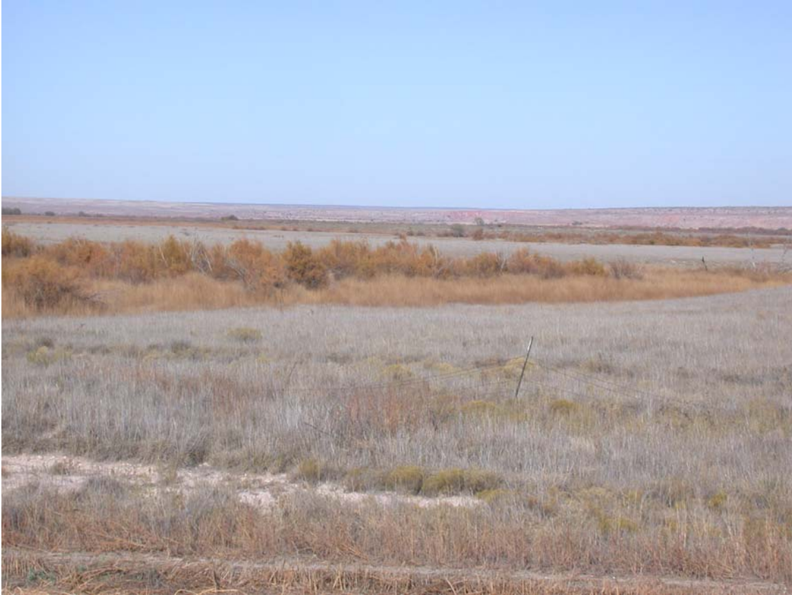
Figure 2. View of South Spring channel flowing across the Pecos River floodplain looking northeast. Photo taken from atop of youngest Lakewood terrace ( Qlt_3 ). Eastern Permian upland bluffs, comprised largely of Seven Rivers formation ( Psr ) gypsum, seen in the distance.

6-9 m, respectively. The view in Figure 2 looks northeast across the Pecos River valley floor to the distant eastern Permian uplands from the lowest and youngest Lakewood terrace, Qlt_3 .