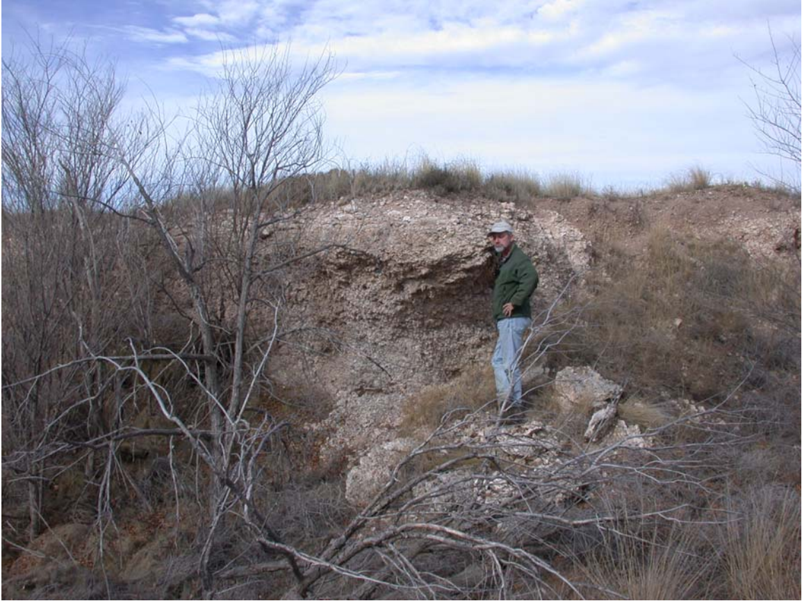
Figure 3. View of western gravel pit wall developed in an old Rio Hondo fan channel ( Qahc 1 ) developed in the oldest fan unit ( Qahf 1 ). Paleoflow directions, based upon clast imbrication varies from 118° to 128° (roughly represented by the observer’s face). The clast count depicted in Figure 4 came from this locality.

The Rio Hondo alluvial fan complex contains numerous alluvial channel deposits, ranging from old, abandoned channels to historic ephemeral streams (formerly perennial – artesian spring-fed). The oldest ( Qahc 1 —which flowed eastward off of the oldest Qahf lobes) were often mapped primarily by soil moisture increases noted on aerial photography, relative to adjacent lobe deposits, as eolian input from these adjacent lobes often mantles the “v-shaped” contours associated with stream channels. Many of both Qahc 1 and Qahc 2 channels are also mapped in this matter due to the fact that their deposits have been “blurred” by plowing and dairy farm agriculture.