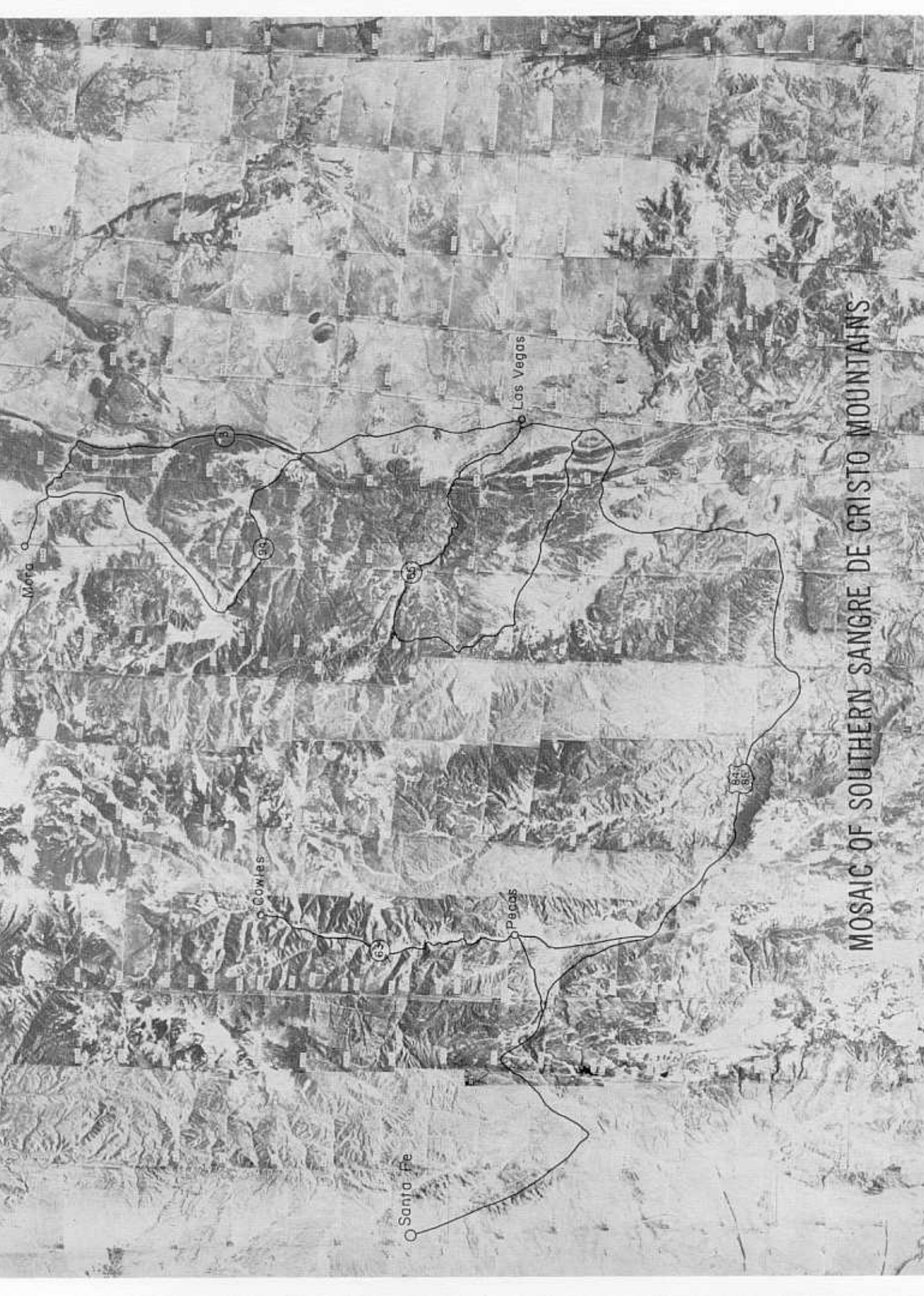
MOSAIC OF SOUTHERN SANGRE DE CRISTO MOUNTAINS