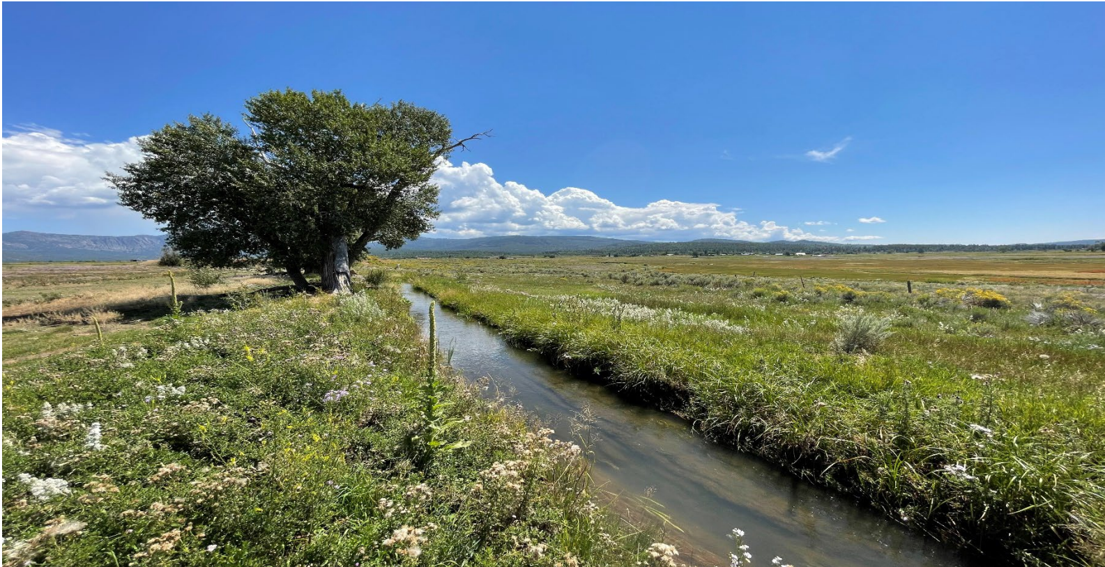
Acequia Chama Basin