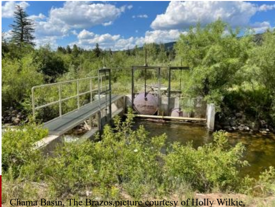
Chama Basin, The Brazos, picture courtesy of Holly Wilkie, Upper Chama Water Master