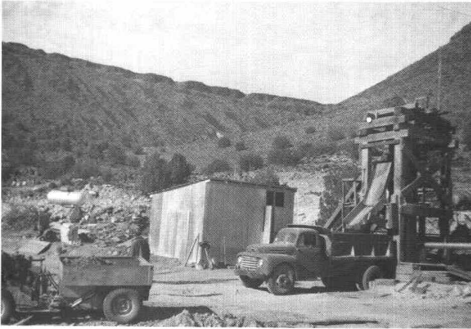
FIGURE 2—Lone Star Mining and Development Corporation was the last to undertake mining operations at LaBajada mine. This photograph was taken in the mid-1950s and shows La Bajada #1 mine and hoist house.

two arms, the Rio Grande arm and the Santa Fe arm (Fig. 1), each primarily fed by its namesake river. The two arms are connected by a conveyance channel. The altitude of the conveyance channel inlet is 5,355 ft above mean sea level (Blanchard, 1993). When the water level in the Rio Grande arm is above an elevation of 5,355 ft, water flows from the Rio Grande arm through the conveyance channel into the Santa Fe arm. When the water level in the Rio Grande arm is below an elevation of 5,355 ft, water flows into the Rio Grande arm from the Santa Fe arm (Blanchard, 1993).