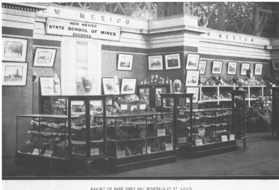
FIGURE 3—The mineralogical display at the St. Louis Worlds' Fair in 1904 relied heavily on the colorful and sometimes quite rare minerals of the Magdalena district to win the gold medal for the Institute. The reputation of the fledgling New Mexico School of Mines spread far and wide as a result.

mense pyramids of showy crystalline ores were embraced in the display. Four large special collections were of particular interest. These consisted of 1) the largest variety of zinc and copper minerals and ores from a single locality; 2) a collection of rare zinc and copper ores; 3) a unique collection of showy crystals of zinc and copper minerals; and 4) a complete smelting proposition from