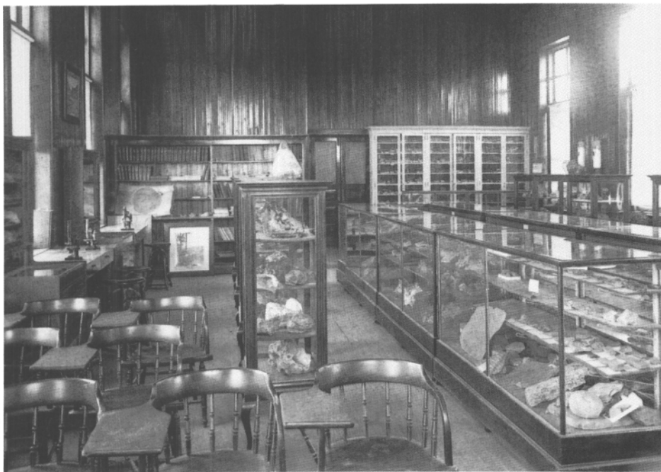
FIGURE 2—The original museum on the first floor, north wing of Old Main, looking south toward the center of the building. The non-display part of the collection was readily accessible to students studying mineralogy, crystallography, and petrology. Note the microscopes, mineralogical library, and students' desks.