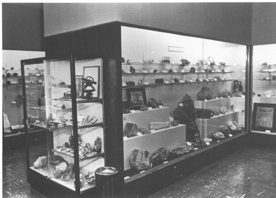
FIGURE 7—The south end of the large New Mexico bay in the Workman Center museum. Notable in the center of the view is the large cluster of selenite roses from west-central New Mexico and the Fayette A. Jones transit and portrait in the new acquisitions case on the left.

sibility when the Bureau could provide appropriate space.