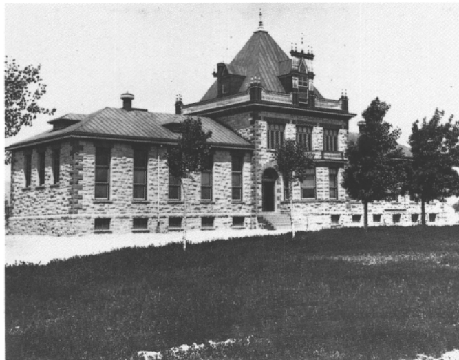
FIGURE 1—Old Main, ca 1910, was home to the original collection through July 1928. Built to withstand the ages, but not fire, it was constructed of grey trachyte (rhyolite quarried west of campus in Blue Canyon) and trimmed with red Arizona sandstone. The museum would occupy, at different times, space in the tower, the basement, and for the longest period, the north wing of the first floor (extreme right in this view).

and storerooms in the basement" (NMSM, 1902, p. 95). The proposal died with Keyes' departure. Both men oversaw the management and use of the collection and the acquisition of new material. Thus the first curators were the Institute presidents themselves. Thereafter, until the collection was transferred to the New Mexico Bureau of Mines, the geology department chairmen would serve as curator of collections.