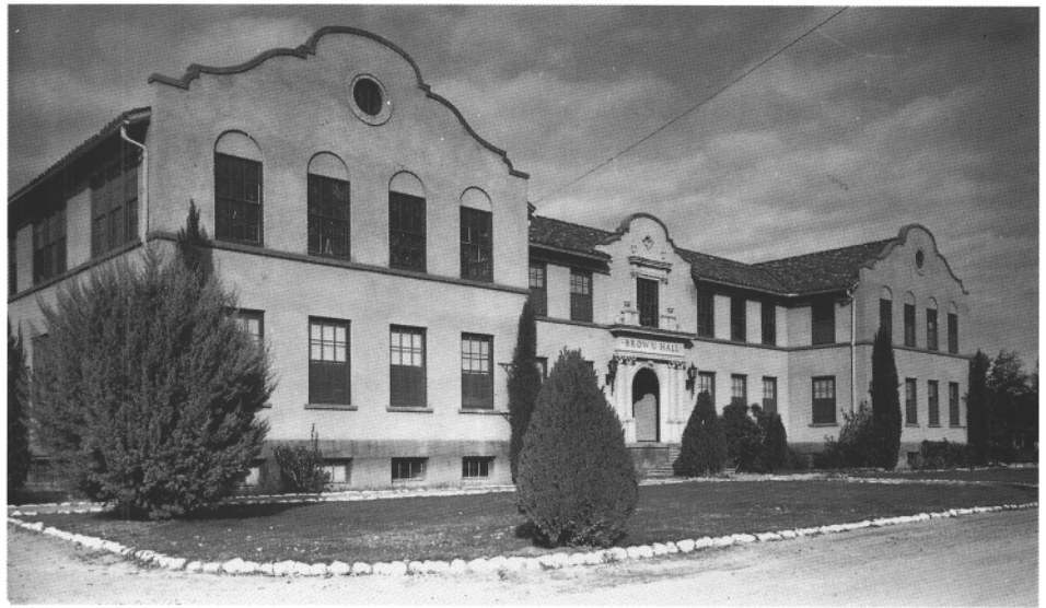
FIGURE 6—Brown Hall, built to replace Old Main lost in the July 1928 fire, is a much larger structure although it occupies the same location. The new collection was temporarily housed in a basement room but spent most of the duration in a large, second floor room on the south end (extreme left) before finally going back to the basement. Brown Hall was home to the museum for nearly 35 years (1929–1964), longer than any other location to date, and was the site of the "Coronado's Treasure Chest" festivities.

which legends are made: if true, the Brown collection would have been lost in the July 1928 fire along with the rest of the museum. The fact is, the school purchased the Brown collection directly from son Tom, in 1938, for the princely sum of $200 (Regents, 1938). One suspects that the purchase price was partly a token amount and partly a reflection of Tom's philanthropy. For the Wells administration, the purchase was a stroke of genius: the collection had finally achieved the high standard of the earlier one, and just in time! (This is not to slight the many contributions made by the alumni of the period who routinely sent specimens, many of them collected while pursuing their worldwide careers, back to Socorro. The catalog is full of their names, and the collection was measurably enriched.)