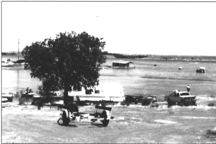
FIGURE 3—Marina at Ute Lake.

Most of the rocks surrounding the lake, including those that form the bedrock of the dam, belong to the Upper Triassic Chinle Group (Fig. 5). The Chinle Group consists of alternating layers of red-brown to buff to maroon to gray mudstone, siltstone, and sandstone that were deposited in continental fluvial and lacustrine environments about 220 million years ago. The Chinle Group is divided into five formations in this area: Santa Rosa, Garita Creek, Trujillo, Bull Canyon, and Redonda Formations (Lucas, 1995). The medium- to light-gray, massive to crossbedded sandstone exposed at the dam was called the "Logan Sandstone" by earlier geologists, but the unit was never formally described or named. More recent investigations indicate that it belongs to the Trujillo Formation, which extends into west Texas (Lucas et al., 1985; Lucas, 1995; Bureau of Economic Geology, 1977; Finch and Wright, 1983). The crossbeds in the sandstone are consistent with fluvial deposition. Mudcracks found in some sandstones indicate subaerial drying of mud, similar to that found in today's climate at Ute Lake. The red color is produced by the oxidation of iron in the minerals forming the sandstone; this oxidation is common to seasonally arid events such as existed at the time the Chinle was deposited.