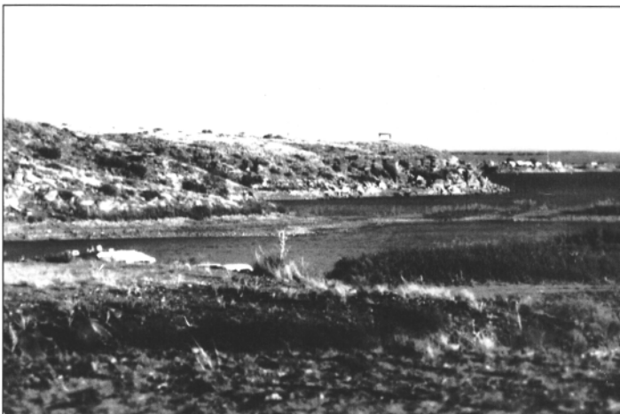
FIGURE 5—Ute Lake, cliffs are sandstones of the Chile Group.