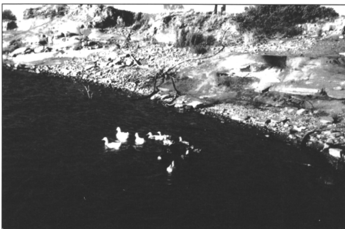
FIGURE 4—Ducks swim along the rocky beach near the marina. The rocks are sandstones belonging to the Chinle Group.