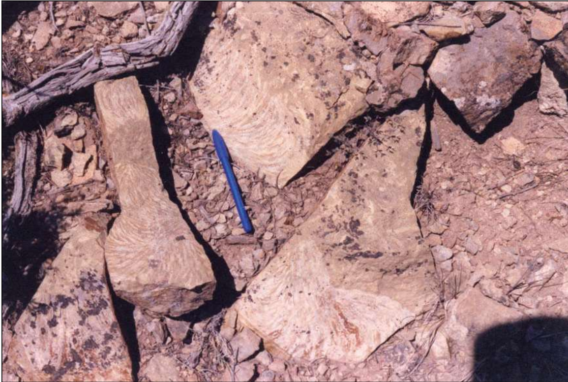
Field view of several Zoophycos traces in Sandia Formation, Guadalupe Box.