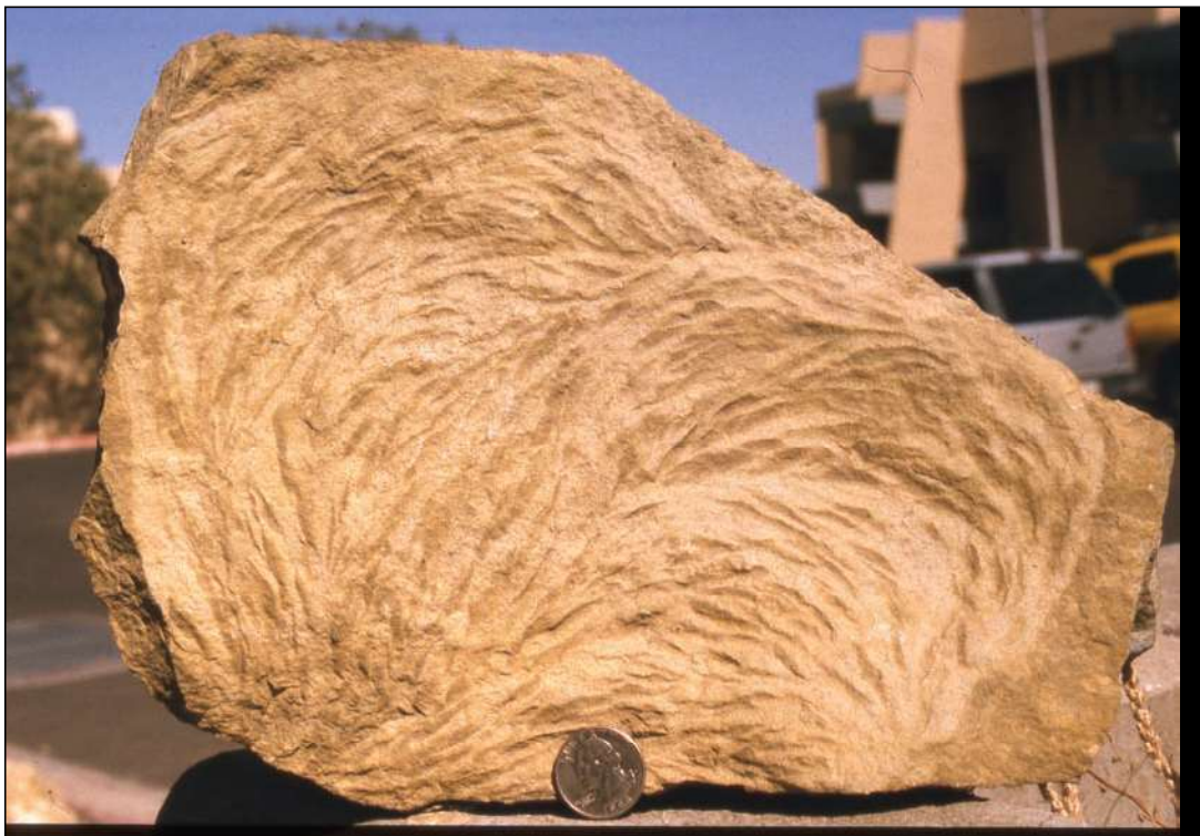
Slab with two large Zoophycos traces in contact; height of slab is 21 cm.