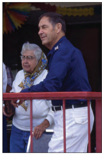
1990 photo courtesy bureau archives, slide number 30040. Gift of Sally Smith.

Rena recalled that field work meant returning hot and hungry to a camp without facilities. "It was over 100 degrees during the