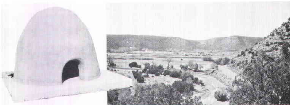
A park drinking fountain, resembling the traditional outdoor ovens of the Pueblo Indians, is shown above. The Glorieta Mesa, entrenched by the Pecos River, is apparent at the right side of the photograph.

One and one-half mi north of the park is the village of Villanueva. Established by early