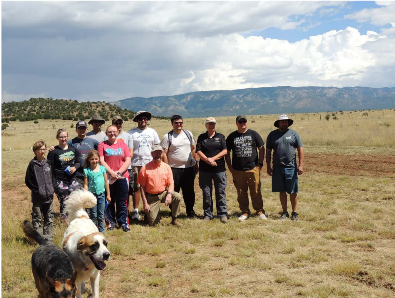
Staff and participants of the New Mexico Basics of .22 rifle shooting clinic, Capitan, September 16-17 , 2017