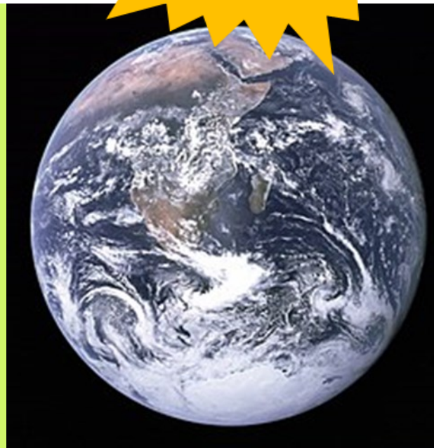
The Blue Marble