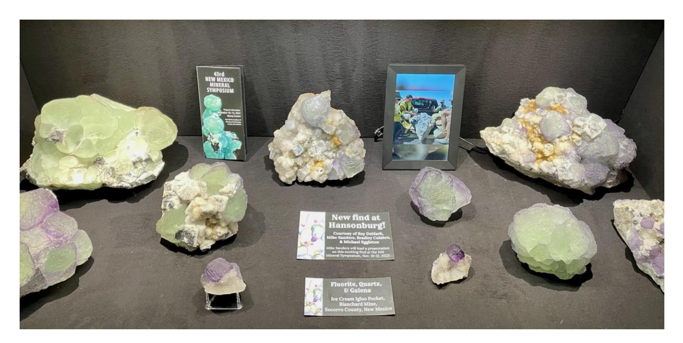
Figure 5. NMBGMR Mineral Museum display of the new find of fluorite at the Blanchard Mine. Denver Hard Rock Summit, September 2023.