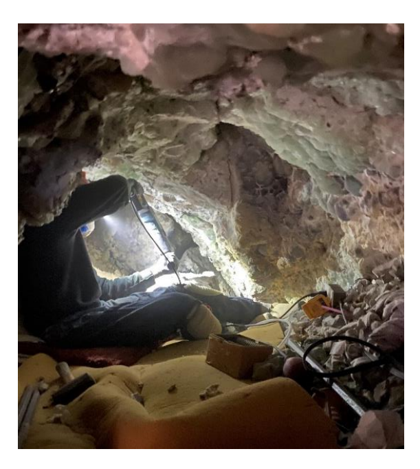
Figure 2: Bradley Culebro drilling feather and wedge holes with an electric hammer drill to split a large slab in the Ice Cream Scoop pocket. May 13, 2023.

However, there was still one giant fluorite specimen that remained in the pocket, which became known as the "Blanchard Beast". It was determined that the only way to recover this approximately 1100 lb. specimen safely was to get a track hoe to the location. With this the Beast could be removed from the pocket and transferred to a vehicle for transport offsite.