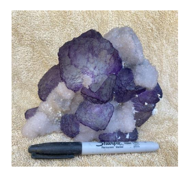
Figure 6: The "360" fluorite, and quartz on galena specimen. 15 cm. across. Collected by Bradley Culebro and Michael Eggleton from the Ice Cream Igloo pocket in early May 2023. Mike Sanders specimen and photo.