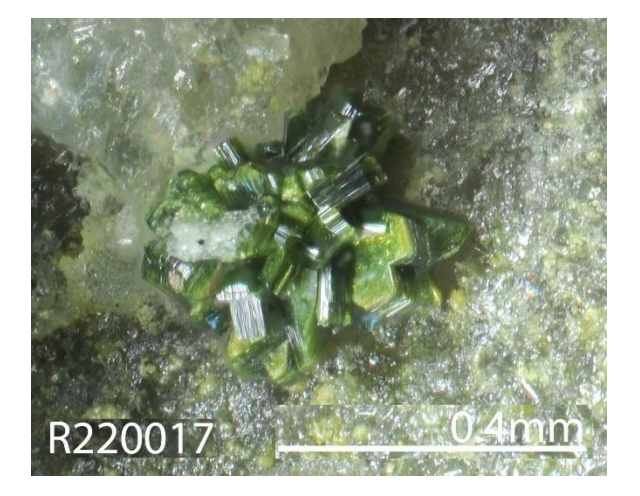
Fifure 2. Virgilluethite, Summit Claim, Cookes Peak, Luna County, New Mexico

Instead, they represent species that form under particular circumstances, However, it has been shown that sidwillite can dehydrate easily to virgilluethite when heated to between 60 and 80 degrees Celsius. Both raydemarkite and virgilluethite will dehydrate to become molybdite upon heating between 110 and 160 degrees Celsius.