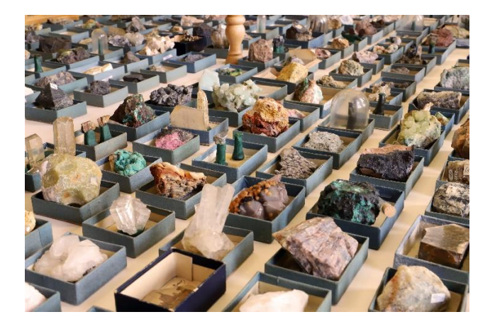
Figure 3. A few minerals from the extensive collection of over 1,500 specimens of M. Adam, donated to the Paris School of Mines in 1881.