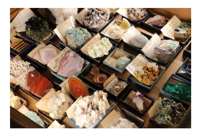
Figure 2. Some of Dolomieu and Marquis de Drée's specimens, purchased by the School of Mines in 1845.