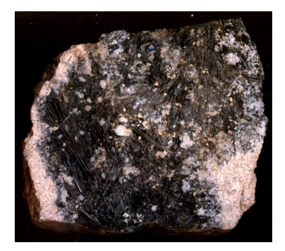
Figure 2. Sprays of schorl crystals intergrown with fluor-schorl from the type locality Zschorlau (formerly known as a village named Schorl), Saxony, Germany. 10 × 6 cm.

A tourmaline-bearing gneiss from an ultrahigh-pressure unit in the Erzgebirge at the northwestern margin of the Bohemian Massif, is exposed in Saxony and the northern Czech Republic. This is part of the Devonian-Carboniferous metamorphic basement of the Mid-European Variscides. A stack of different tectono-metamorphic units, each with distinct pressure-temperature histories, characterizes the region. The investigated sample is from the diamond- and coesite-bearing gneiss-eclogite unit. The occurrence of diamond in the felsic gneisses requires pressures in excess of 4 GPa (Fig. 3). Peak metamorphic conditions may have been even higher (8 GPa at >1050 °C; Massonne, 2003). The sample was collected as a loose decimeter-sized block from a small creek near Forchheim, Pockau, Erzgebirge, Saxony, Germany. It is a felsic, medium-grained, granulite-facies mylonite displaying strongly