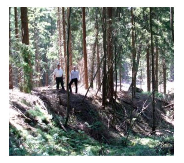
Figure 1. Historical mining dumps near the village Zschorlau, Saxony, Germany. Type locality for schorl and fluor-schorl. Photo was taken in 2006.

The early history of the mineral schorl shows that this name was in use prior to the year 1400 AD because a village known today as Zschorlau (in Saxony, Germany) was then named "Schorl" (or minor variants of this name). This village had a nearby tin mine where, in addition to cassiterite, a lot of black tourmaline was found (Ertl, 2006). There are historical mining dumps where schorl can still be found (Fig. 1). Around 200 years later the first relatively detailed description of schorl and its occurrence (various alluvial tin deposits and tin mines in the Erzgebirge) was published by Johannes Mathesius in 1562 (Ertl, 2006). He described schorl originally as "schürl", with the properties black, a lighter weight than cassiterite ("zynstein") and that it breaks easily.