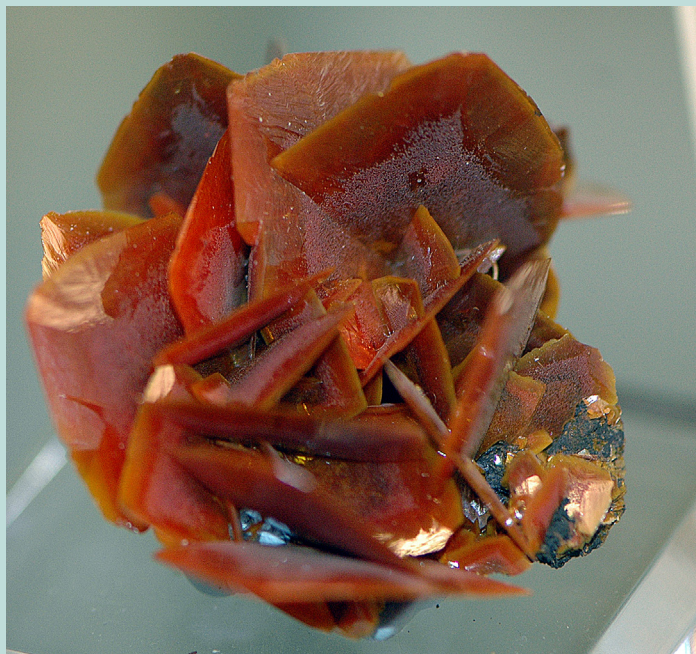
A small cabinet specimen of wulfenite from the Jianshan Mine, China. The specimen is about 1.5 inches across.