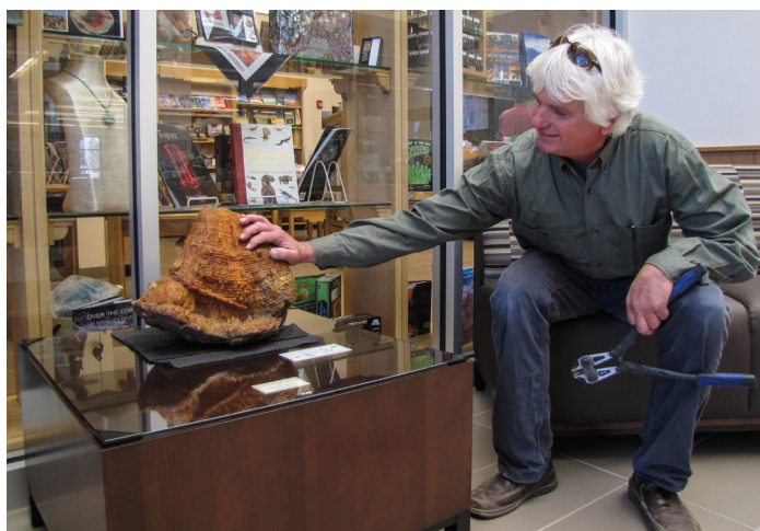
Chalcedony replacing coral specimen from the Withlacoochee River area of Florida is one of our new “touch and feel rocks.” They are secured to their tables by cables that run through the specimens, that’s what the bolt cutter is for...