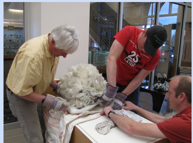
Large scolecite specimen from India requiring some gentle treatment, those crystals are sharp!

New displays have been recently installed in the atrium of the New Mexico Bureau of Geology Building, immediately outside the museum gallery. In addition to the cases, new "hands on" displays have been added. These displays consist of an amazonite-quartz group from Colorado and chalcedony replacing coral from Florida. Lots of selfies showing up on Facebook posed with our newest rock stars!