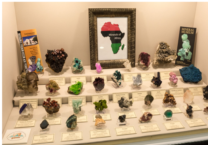
Our display of African Minerals at the Denver Show.