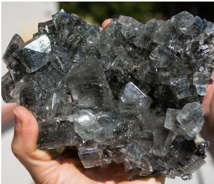
Calcite with inclusions of marcasite from the Linwood Quarry, Iowa. You might remember a few years ago a good number of barite specimens came from the same locality. This piece will fit nicely with the barite we acquired years ago.

We acquired some very nice pieces during the Denver show this year. A couple of the recent acquisitions are shown below. It seems we were presented with more opportunities to obtain interesting species rather than many “showy” pieces. These unusual pieces include a 10 cm crystal group of Chevkinite-(Ce) from Pakistan, and Volkovskite, a new borate from under the North Sea, which was recently featured in Rocks and Minerals magazine.