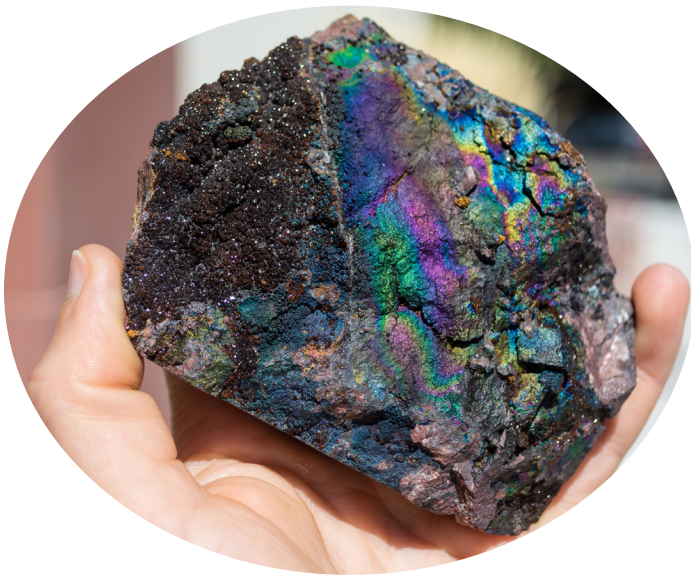
Jarosite (the greatest mineral on this planet and on Mars) and turgite (hydrated iron oxide) from Ajo, Arizona. A recent acquisition at the Denver Show.

We are looking forward to continuing this display format for some years to come. If you are interested in participating, just contact the museum director and we can discuss the particulars.