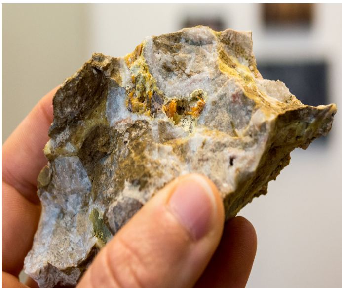
Tellurite (no hand lens or microscope needed to see it!) from the Moctezuma mine, Sonora, Mexico.