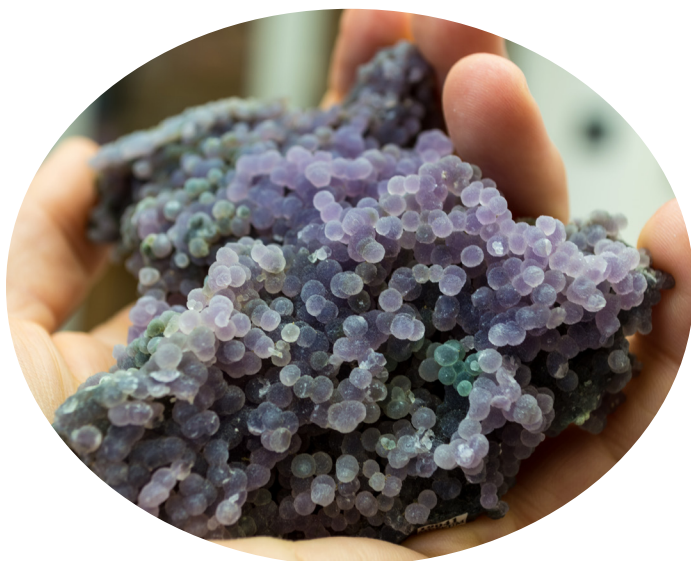
One of our new acquisitions at the Denver Show, a "grape agate" from Indonesia.

The Denver Show is getting more and more like Tucson, with multiple venues scattered across the northern part of the city. Show locations ranged from just east of Golden to the usual hotels at the "Mousetrap" (intersection of I-25 and I-70) east to the Coliseum area. Word has it that the Ramada Show (ex-Holiday Inn) is moving out to the airport, east of the city. Can't get any farther apart than that!