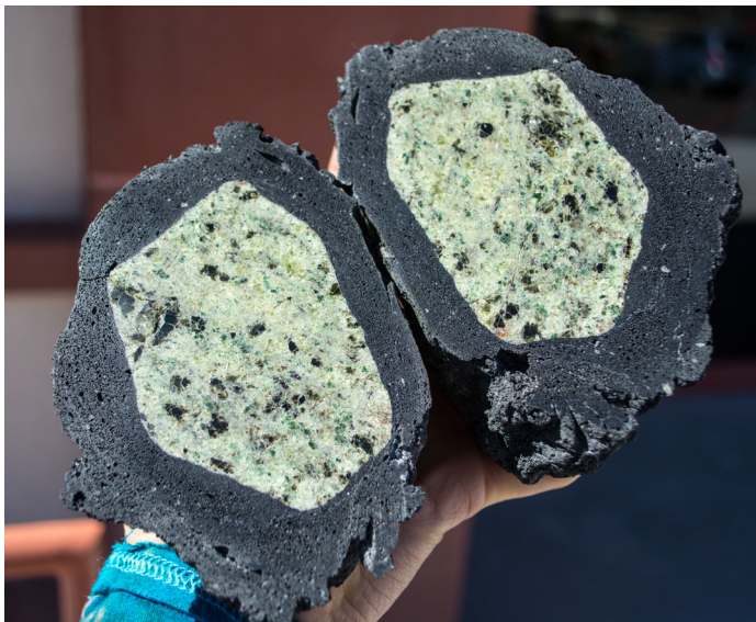
Basalt bomb with a mantle xenolith inside from Guadalupe Island, Municipio de Ensenada, Baja California, Mexico.