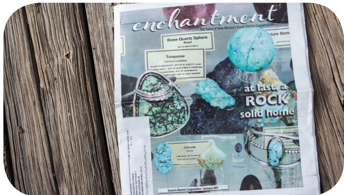
Turquoise in the Lapidary Display made the front cover of the January 2017 edition of Enchantment Magazine.

We started off the new year as the featured article in the January 2017 Enchantment Magazine, which is a monthly publication produced by the NM Rural Electric Co-op. Ellen Rippel produced a nice write-up with photos on the Mineral Museum. If you don't receive this magazine, feel free to peruse the article at this site: https://issuu.com/enchantmentmagazine/docs/january-2017-enchantment