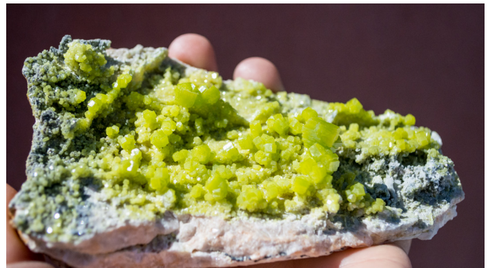
Pyromorphite on barite from The San Andres Mine, Espiel, Cordoba, Andalusia, Spain.