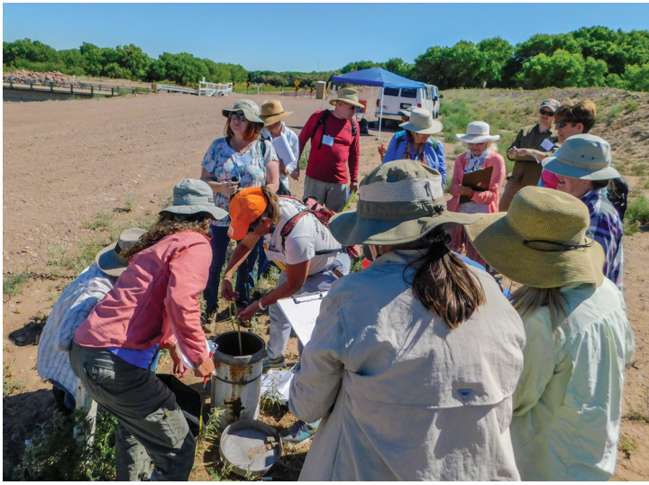
Rockin' 2019: Teachers measure depth to groundwater on a well near the river.