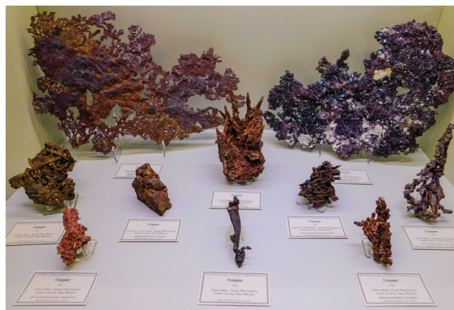
East Coast Show 2019: The aesthetically geometric Chino copper display!

Once we arrived back in New Mexico with all of the minerals, Virgil was able to sleep. Please enjoy a few photos from the fabulous experience!