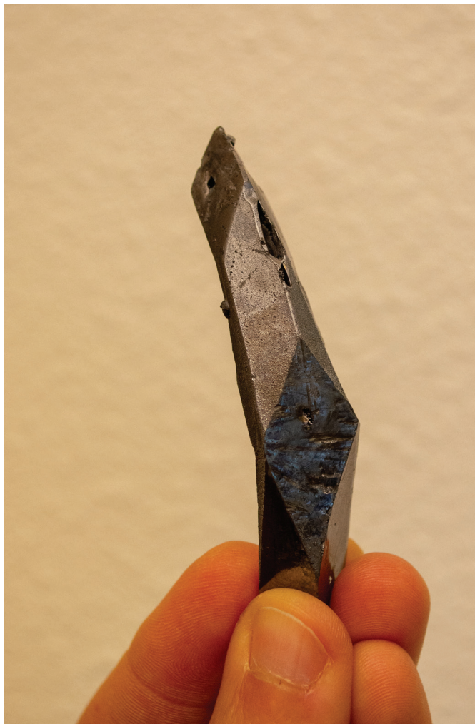
Galena, Fletcher Mine, Viburnum Trend, Reynolds Co., Missouri, MM# 19588.