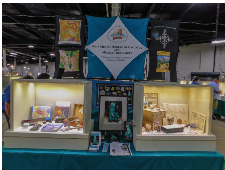
East Coast Show 2019: Our NMBGMR display backdrop, along with a beautiful Wilda watercolor of our flagship smithsonite. Even the tablecloths were Kelly blue!