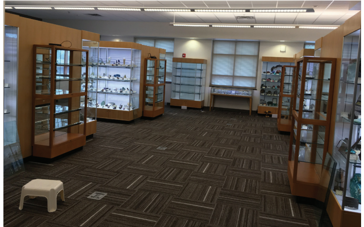
Four additional Waddell cases were installed at each end of larger walk-in displays.