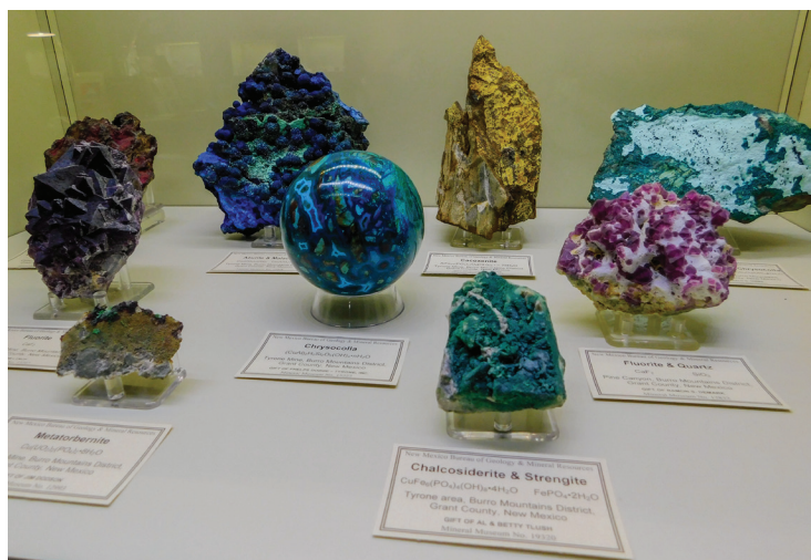
East Coast Show 2019: A portion of the colorful Tyrone Mine display.