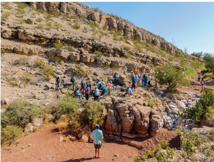
Rockin' 2019: Teachers investigate marine invertebrate fossils and sedimentary structures in Pennsylvanian Madera Group limestones.