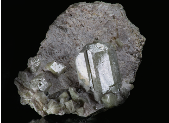
Fluorapatite, Rock Springs Canyon, Doña Ana Co., New Mexico. Largest crystal measures 55 mm tall, photo courtesy of Michael Michayluk, MM# 19583.