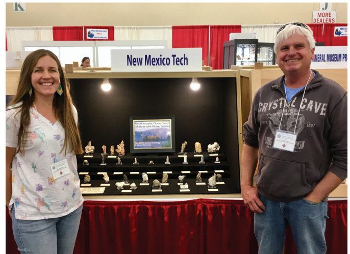
Denver 2019: All smiles and pseudomorphs in Denver.