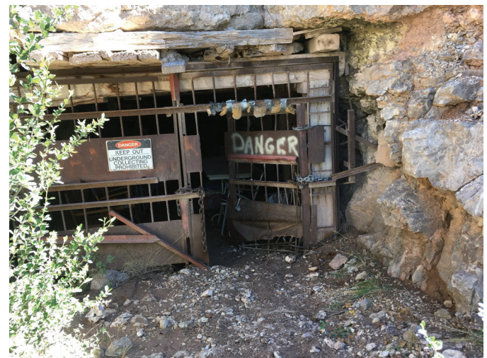
Women's Mineral Retreat 2019: Danger! Entrance to the Sunshine #1.