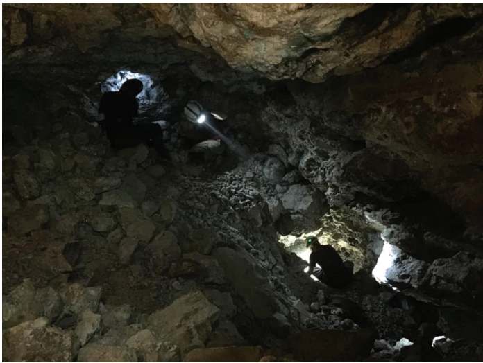
Women's Mineral Retreat 2019: A pocket here, a pocket there, pockets everywhere!