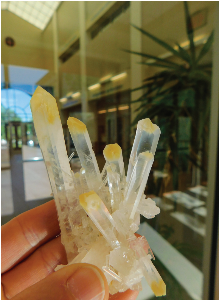
Quartz, Cabiche, Boyacá Department, Colombia, MM# 19589.