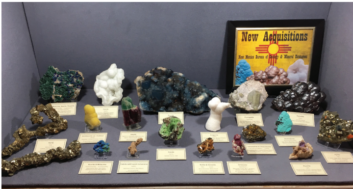
Silver City Show 2019: A display of minerals with good color and nice form. We decided to highlight many of our NM acquisitions, including Bosque Draw pyrite chains and the large fluorapatite from Rock Springs Canyon.

The Silver City Show is always a fun time, taking place over Labor Day weekend. This show includes field trips and presentations each day of the show. We always bring a display of colorful New Acquisitions, from New Mexico and around the world.