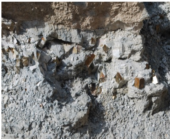
Mina Victoria, Navajun, Spain pyrite occurrence (field of view, 3 feet across).