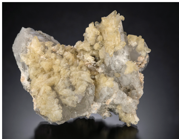
Yellow doubly-terminated calcite crystals on a cluster of quartz crystals. 8 x 6 cm. Bagdad pit, 2900 bench. Muntyan collection.