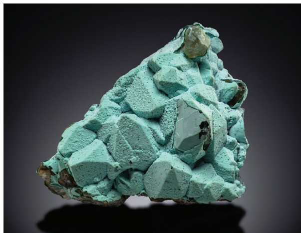
Chrysocolla over quartz. 8.5 x 7 cm. Bagdad pit, 3050-N bench. Muntyan collection.

As active mining continues, there is also the possibility of additional finds. A major pushback of the Bagdad pit margins is under consideration by Freeport MacMoRan (2021) because of the recent surge in copper prices. Thus, collectors may hope that there will be more specimens to come as pit expansion occurs. Only time will tell.