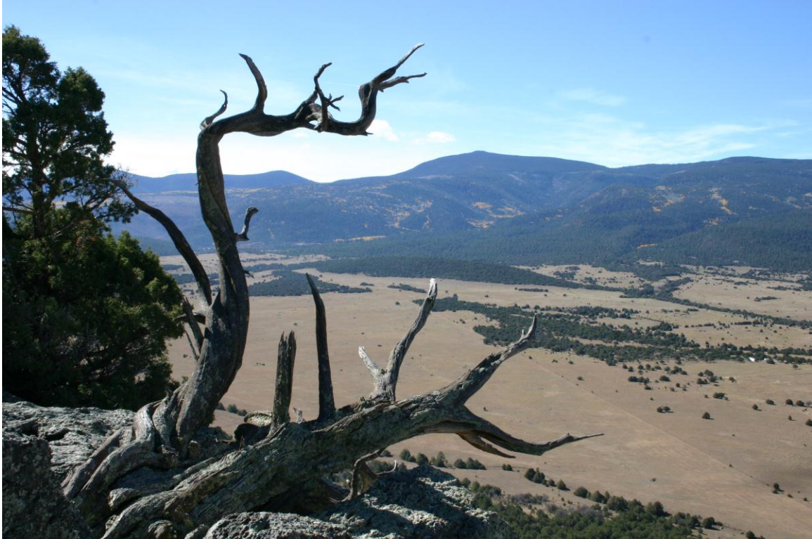
View from the west side of Lobato Mesa looking southwest toward Tschicoma Peak. The aspen-covered high ridge in the center of the photograph is the dacite of Mesa de la Gallina flow. The flat area in the foreground is Mesa El Alto.