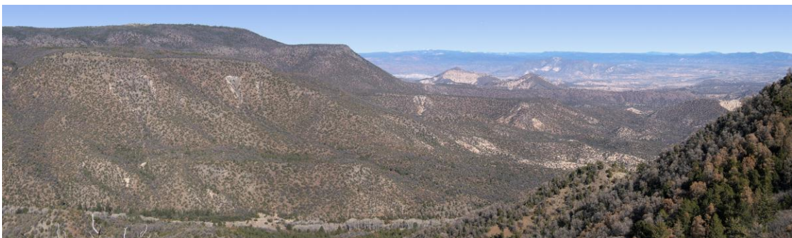
View looking north across the Rio del Oso drainage. The mesa on the left is the east end of Lobato Mesa, capped by flows of Lobato Formation basalt. The light-colored areas on the slopes of the mesa are Ojo Caliente Sandstone.