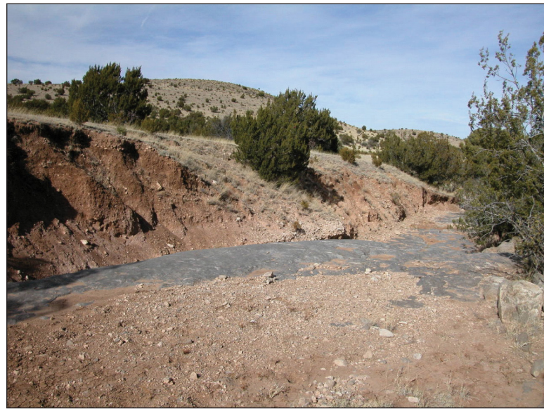
Thick Qes deposits on Rio Bonito Member.