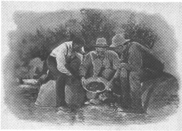
FIGURE 2—The gold pan continues to be an excellent quantitative device to assess the potential of a placer deposit. Then as now, the finer points of the art are best passed on to the novice by a seasoned professional. Postcard with 1898 copyright, courtesy of R. W. Eveleth.